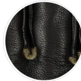
Area between fingers is specially constructed