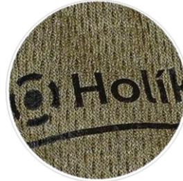
3-layer EffiSHELL laminate