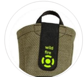
Long cuff and non-flammable pull